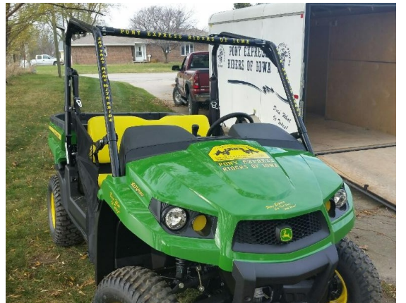
Raffle 2016 John Deere XUV 550 or $2,000 cash option $1 Per Ticket